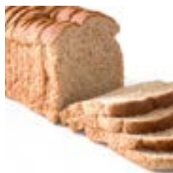
Bread Wheat Loaf