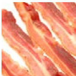
Bacon 1 lb.

Did you know that farmers and ranchers receive only 14.3* cents of every food dollar that consumers spend? According to the USDA, off farm costs including marketing, processing, wholesaling, distribution and retailing account for more than 80 cents of every food dollar spent in the United States.