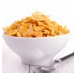
Corn Cereal 18 oz. box