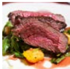
Top Sirloin Steak 1 lb.