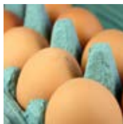
Eggs 1 dozen