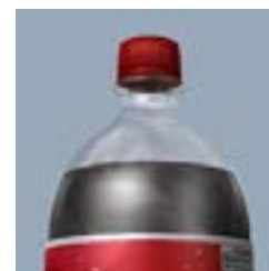
Soda 2 liters