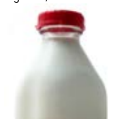
Milk 1 gallon, fat free