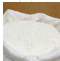
Flour All Purpose, 5 lbs.