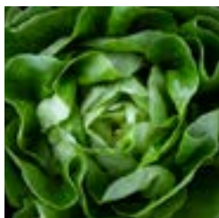
Lettuce 1 lb.