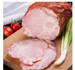
Boneless Ham 1 lb.