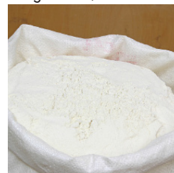
Flour King Arthur, 5 lbs.