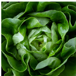
Lettuce 1 lb.