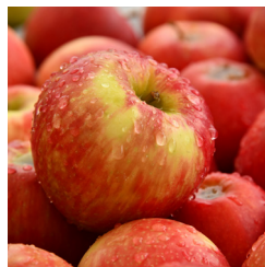
Fresh Apples 1 lb.