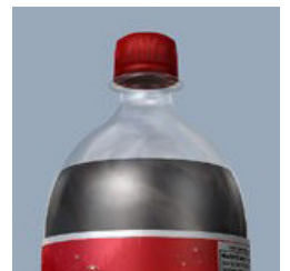
Soda 2 liters