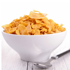
Corn Cereal 18 oz. box