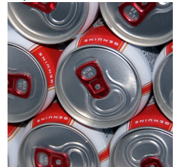
Beer 6-pack cans