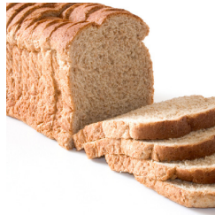
Bread 2 lbs.