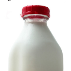
Milk 1 gallon, fat free