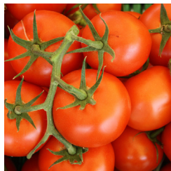
Tomatoes 1 lb.