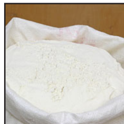
Flour 5 Pounds