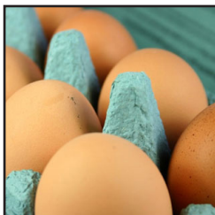
Eggs 1 Dozen