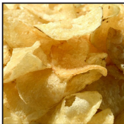
Potato Chips Lays Classic, 10.5 oz