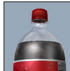
Soda Two Liter Bottle