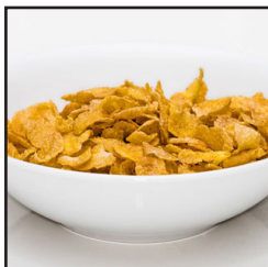
Cereal 18 Ounce Box