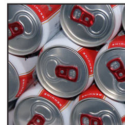
Beer 6-Pack Cans