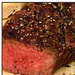
Top Sirloin Steak 1 Pound