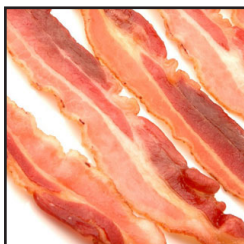
Bacon 1 Pound

According to USDA, off farm costs including marketing, processing, wholesaling, distribution and retailing account for more than 80 cents of every food dollar spent in the United States.