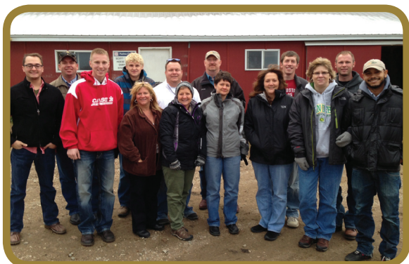
Beginning Farmer Institute participants gained firsthand experience during a session in Minnesota