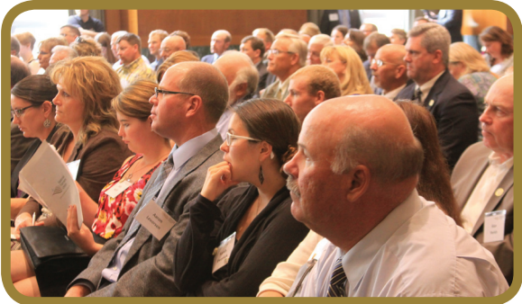
NFU members at the Fall Legislative Fly-In

Worked with biotech industry on an agreement that outlines a process for pending patent expiration of agricultural biotech traits to ensure farmers access to more affordable generic genetically modified seed