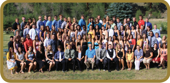
Young leaders at NFU's All-States Leadership Camp

Provided member records management services for 12 state organizations