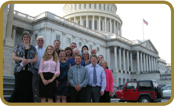
Wisconsin Farmers Union members on the U.S. Capitol steps

Continued to support key principles of the TRADE Act to be included in all free trade agreements, including TPP