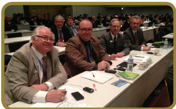
Farmers Union leaders at the WFO General Assembly in Japan

INTERNATIONAL LEADERSHIP Expanded international outreach by sending members to do volunteer work in Africa through the Farmer-to-Farmer Exchange program