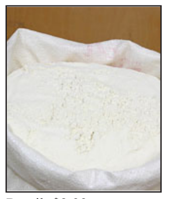
Retail: $2.99 Farmer: $0.93