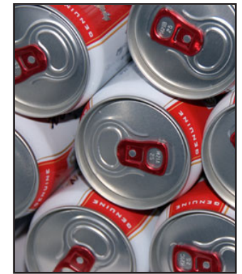
Retail: $6.49 Farmer: $0.05