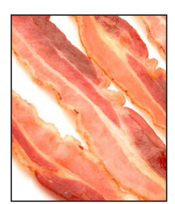
Retail: $5.49 Farmer: $0.92