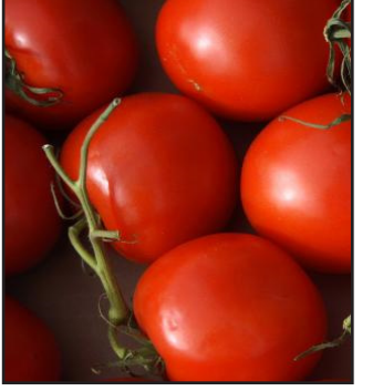
Retail: $3.28 Farmer: $0.54