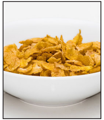
Retail: $3.99 Farmer: $0.10