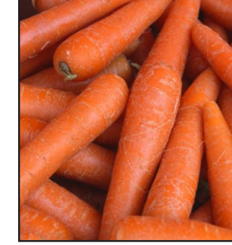
Retail: $3.69 Farmer: $1.81