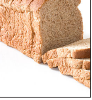
Retail: $3.89 Farmer: $0.19