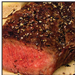
Top Sirloin Steak 1 Pound