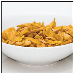
Cereal 18 Ounce Box