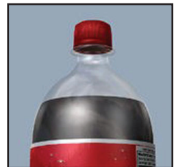
Soda Two Liter Bottle