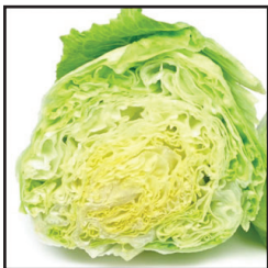
Lettuce 1 Head (2 Pounds)