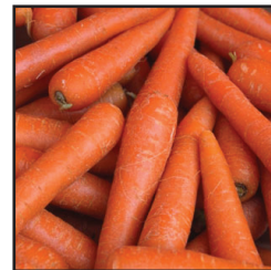
Fresh Carrots 5 Pounds