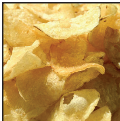
Potato Chips Lays Classic, 10.5 oz