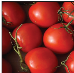
Tomatoes 1 Pound