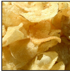
Potato Chips Lays Classic, 10.5 oz