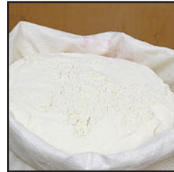
Flour 5 Pounds