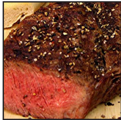
Top Sirloin Steak 1 Pound