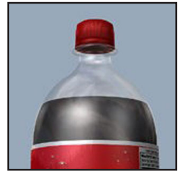
Soda Two Liter Bottle