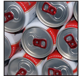
Beer 6-Pack Cans