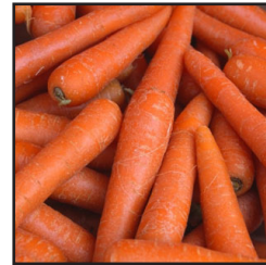
Fresh Carrots 5 Pounds