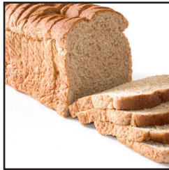
Bread 2 Pounds