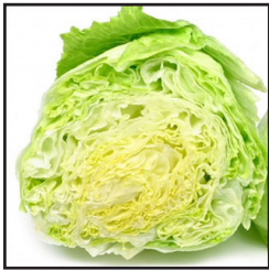
Lettuce 1 Head (2 Pounds)