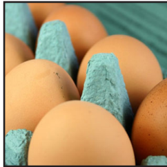
Eggs 1 Dozen