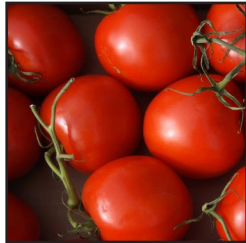
Tomatoes 1 Pound