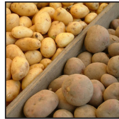
Fresh Potatoes Russet, 5 Pounds