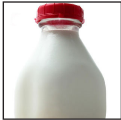
Milk 1 Gallon, Fat Free