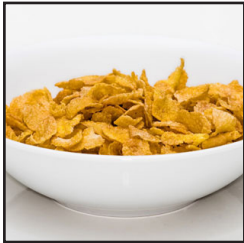
Cereal 18 Ounce Box