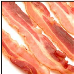
Bacon 1 Pound

According to USDA, off farm costs including marketing, processing, wholesaling, distribution and retailing account for more than 80 cents of every food dollar spent in the United States.