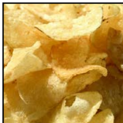
Potato Chips Lays Classic, 10.5 oz