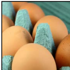
Eggs 1 Dozen