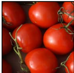
Tomatoes 1 Pound