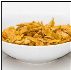
Cereal 18 Ounce Box