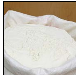
Flour 5 Pounds