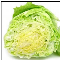
Lettuce 1 Head (2 Pounds)