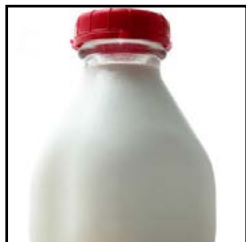
Milk 1 Gallon, Fat Free