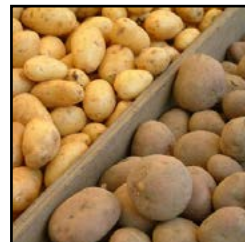
Fresh Potatoes Russet, 5 Pounds