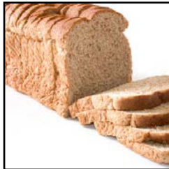
Bread 2 Pounds