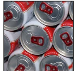
Beer 6-Pack Cans