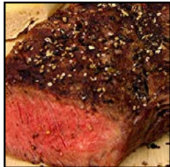
Top Sirloin Steak 1 Pound