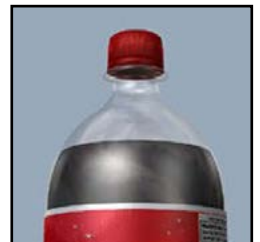
Soda Two Liter Bottle