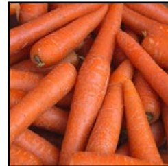
Fresh Carrots 5 Pounds